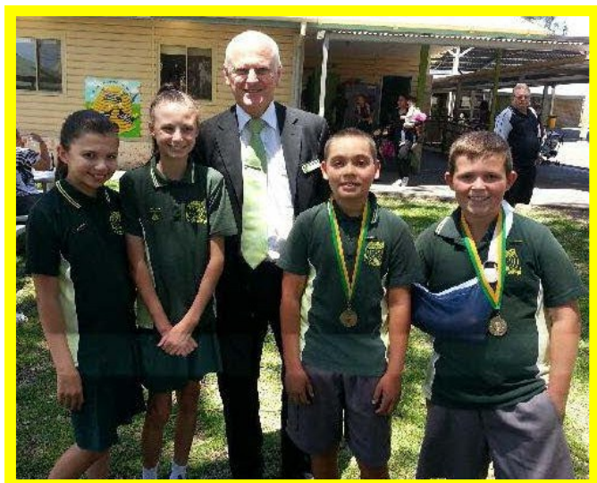
CONGRATULATIONS TO THE 2014 Student Leaders