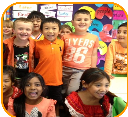
Some of the colour of Harmony Day

One such area we need to develop in our students over the course of their years at GVPS is a stronger understanding of respect.