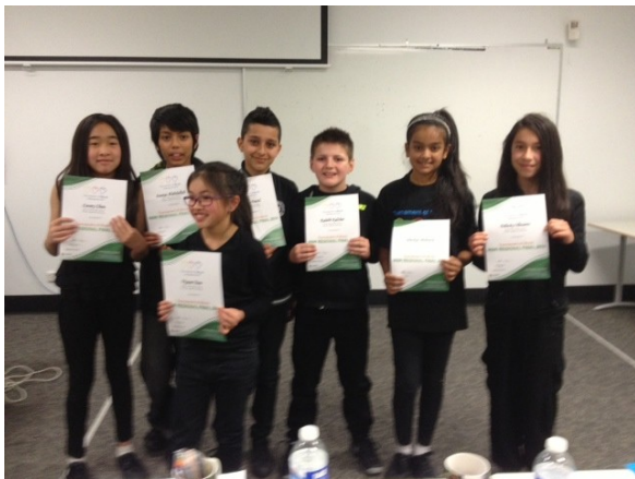
Applied Technology Challenge Team Design a new product. How about an "Appy Nappy"