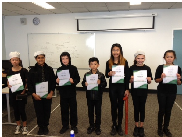
Social Science Challenge Team . Should the Leaning Tower of Pisa be Moved to New Zealand and Why?