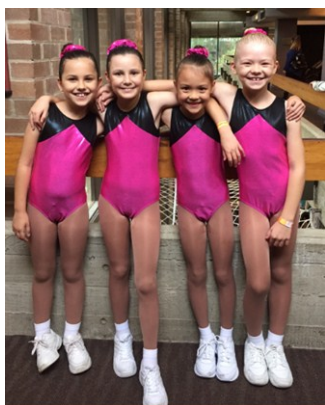
The Valley Vivas